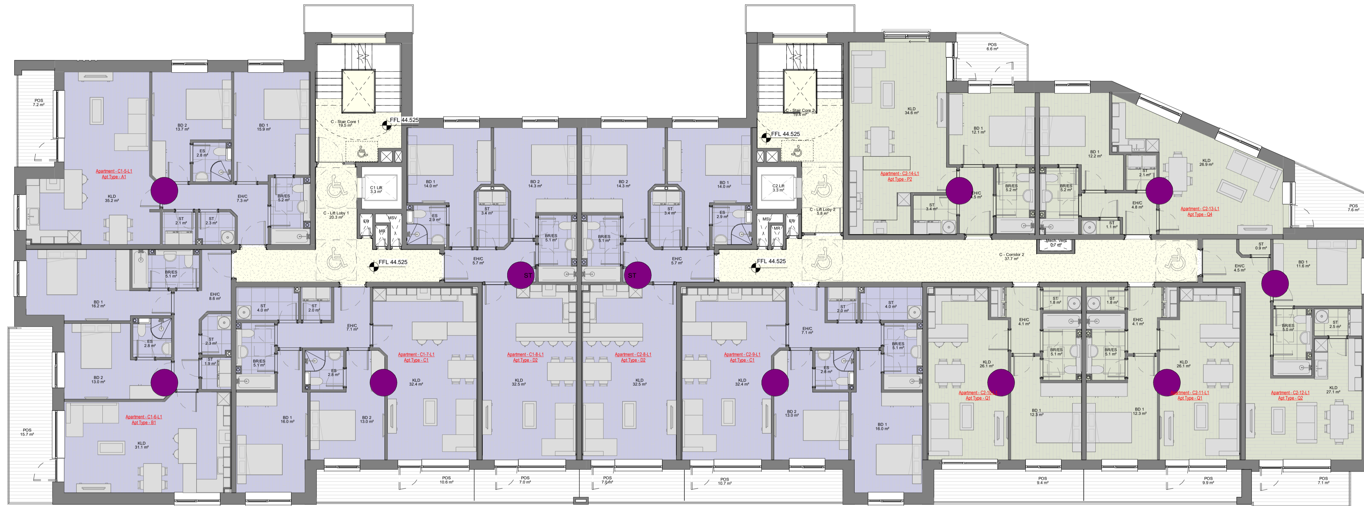
1 GA PART V - First Floor Plan 1 : 100